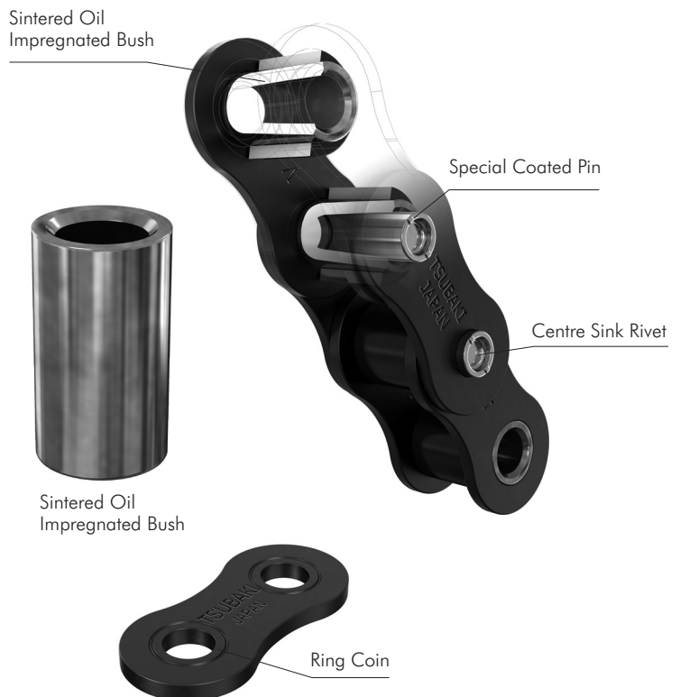
Fig. 10 Basic Construction

Standard BS roller chain sprockets can be used. However, due to the extended lifetime of BS LAMBDA chain, TSUBAKI recommends to install sprockets with hardened teeth in every LAMBDA application.